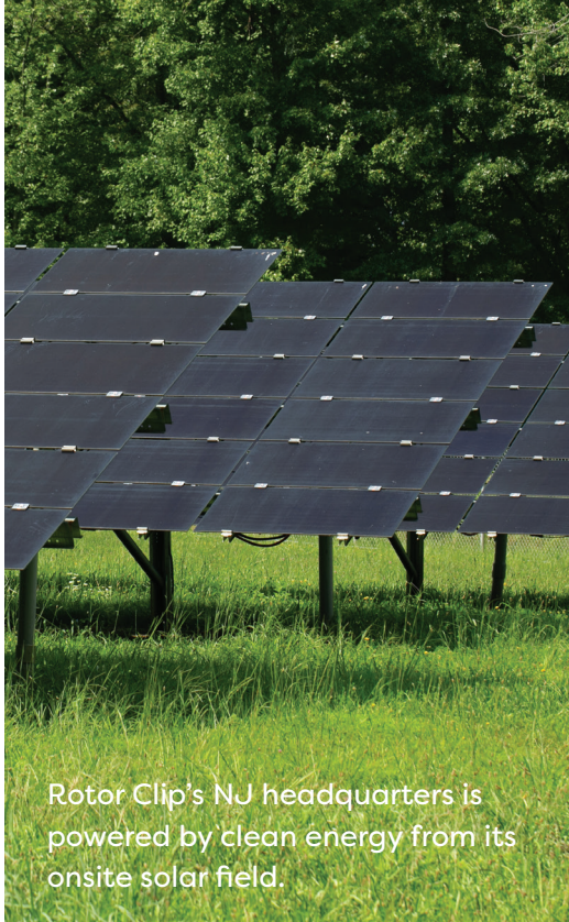
Rotor Clip's NJ headquarters is powered by clean energy from its onsite solar field.